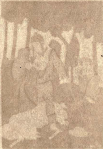
Faded text, likely a caption or description of the photograph, possibly mentioning names or dates.